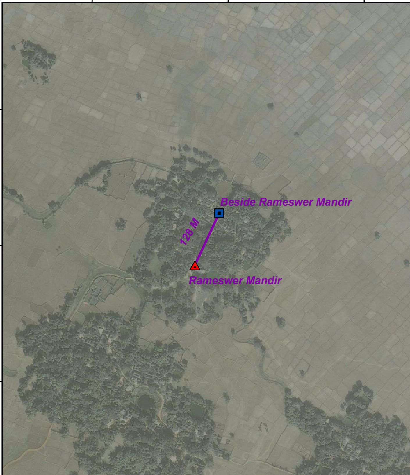
Plate : BAL 23a